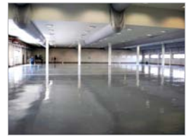
CSI Division 9: Finishes - Flooring