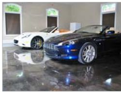
CSI Division 9: Finishes - Flooring